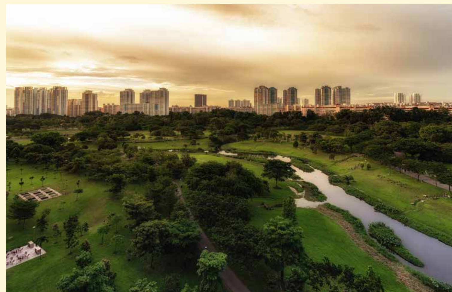
IMMERSE YOURSELF INTO THE LUSH, NEIGHBOURING PARKS VIA CYCLIST-FRIENDLY PARK CONNECTORS

MYRA's location is at the heart of a major URA initiative to intensify the greening of Serangoon. A mere kilometre away from MYRA is a new 1.6km-long park connector – the Bidadari Greenway and Bidadari Park. The park's masterplan envisions it to be a car-lite and cyclist-friendly community with seamless connectivity to Bishan, Kallang, Serangoon, Ang Mo Kio, Seletar, Sengkang, all the way up to Punggol. All around MYRA is a multitude of options.