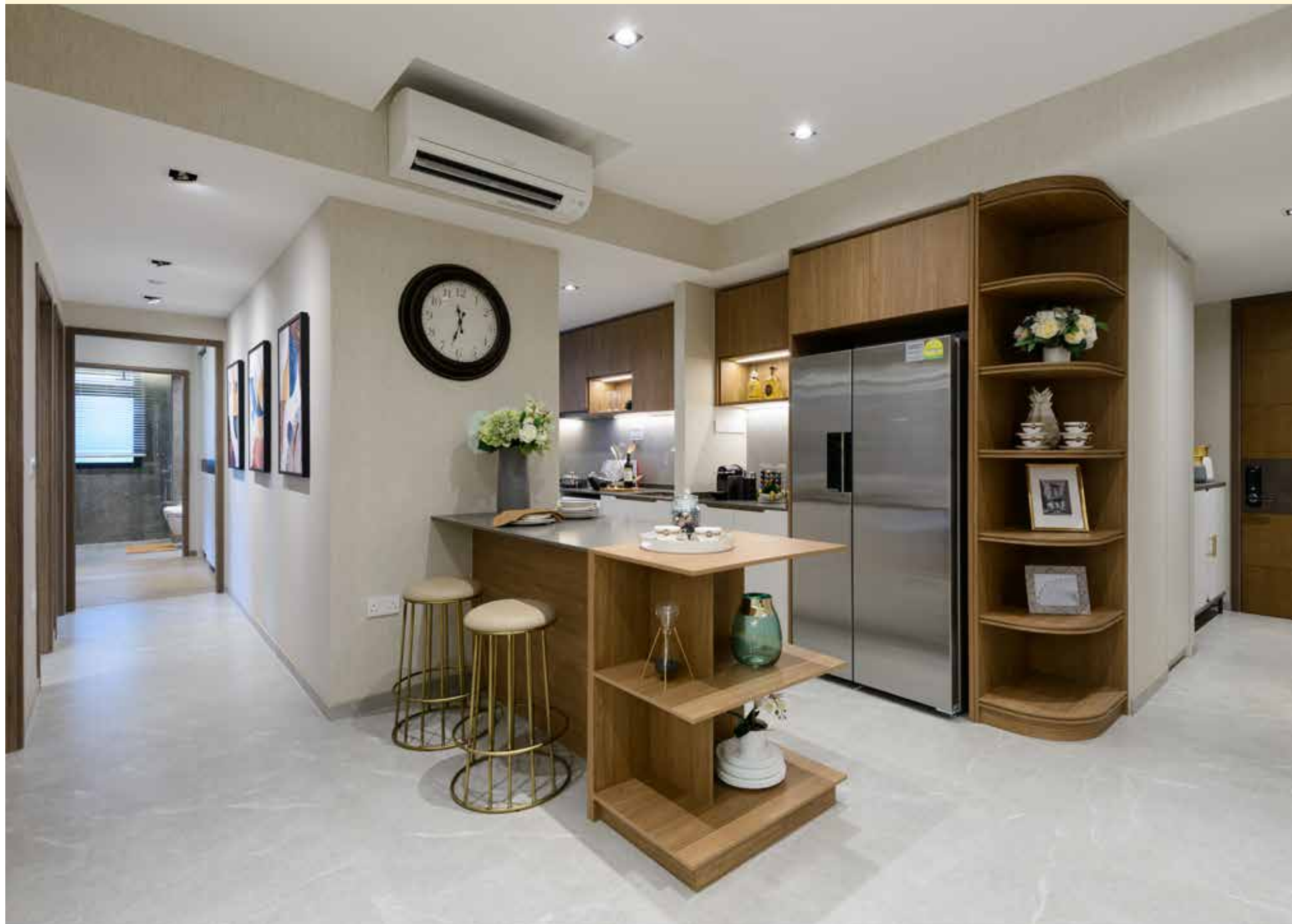
KITCHEN (TYPE D1) SHOW UNIT PHOTO