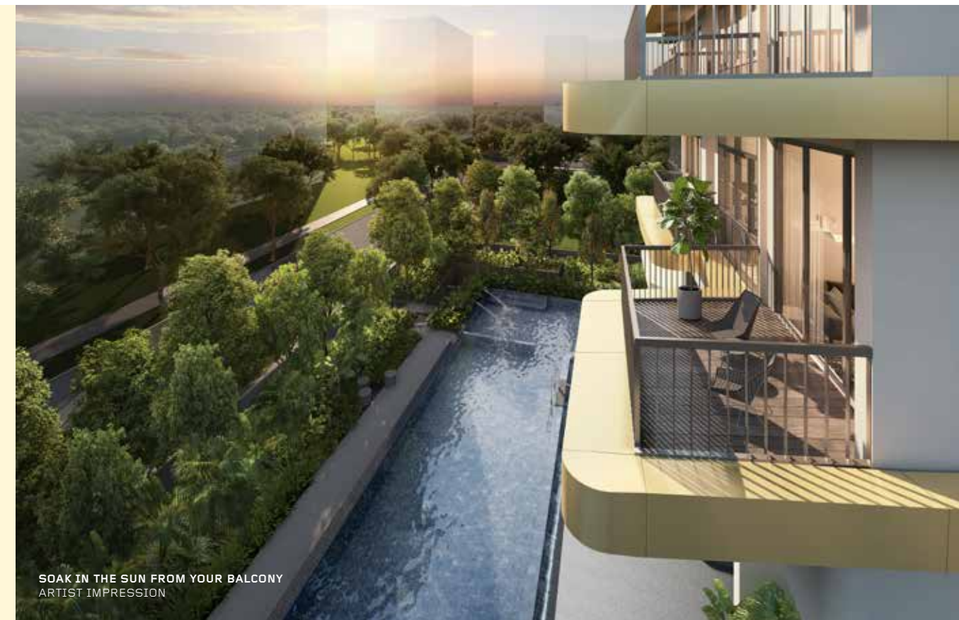
SOAK IN THE SUN FROM YOUR BALCONY ARTIST IMPRESSION