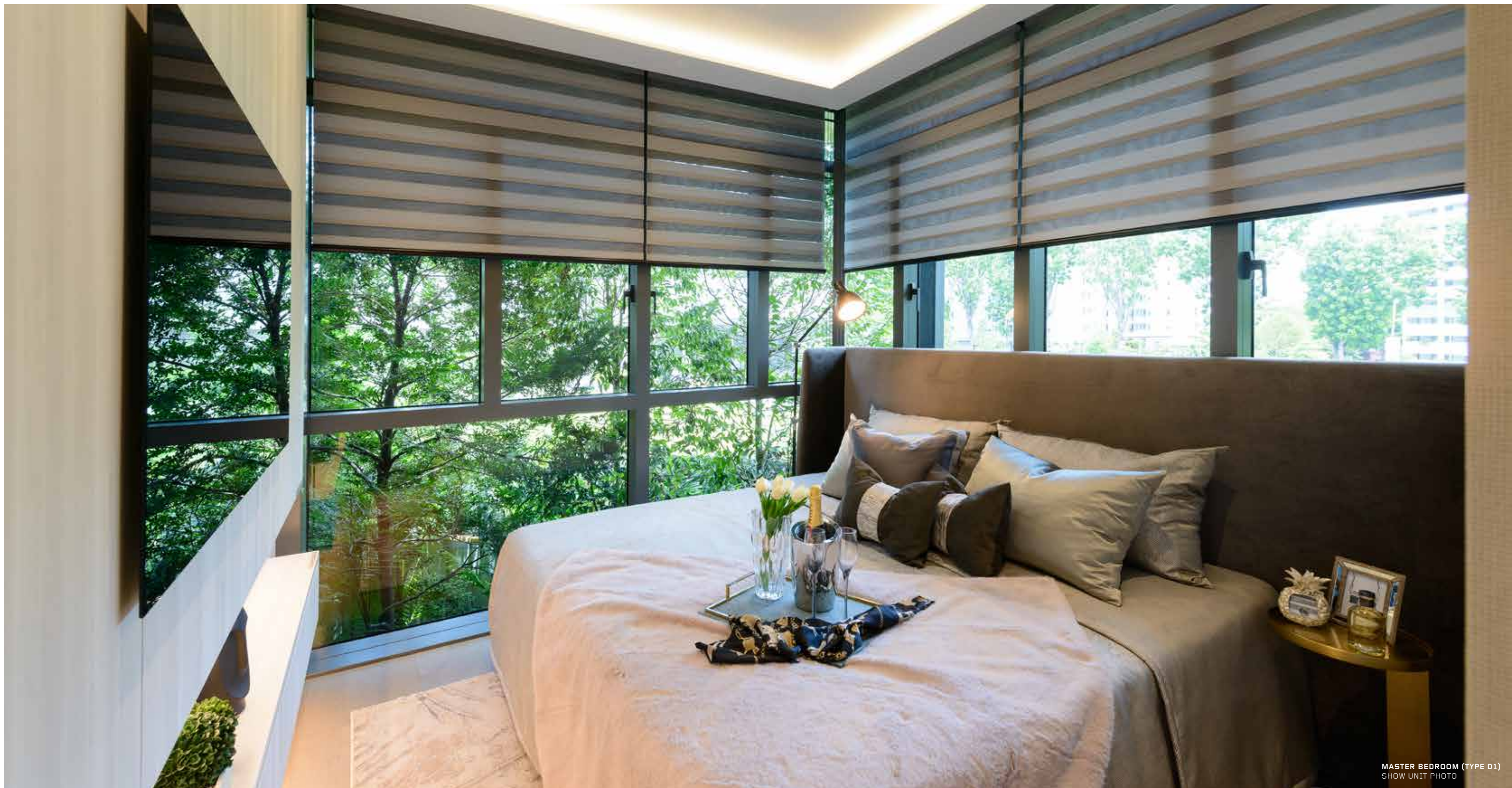
MASTER BEDROOM (TYPE D1) SHOW UNIT PHOTO