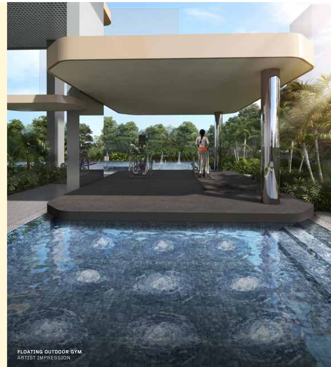
FLOATING OUTDOOR GYM ARTIST IMPRESSION

Then, northwards, discreetly shaded by a thicket of plantings that spans almost the entire breadth of the tower, lies the outdoor dining area with an attached bar. In this serene setting that is just adjacent to the Grand Lobby, you're surrounded by lush ferns and fern trees that will make a truly memorable dining experience.