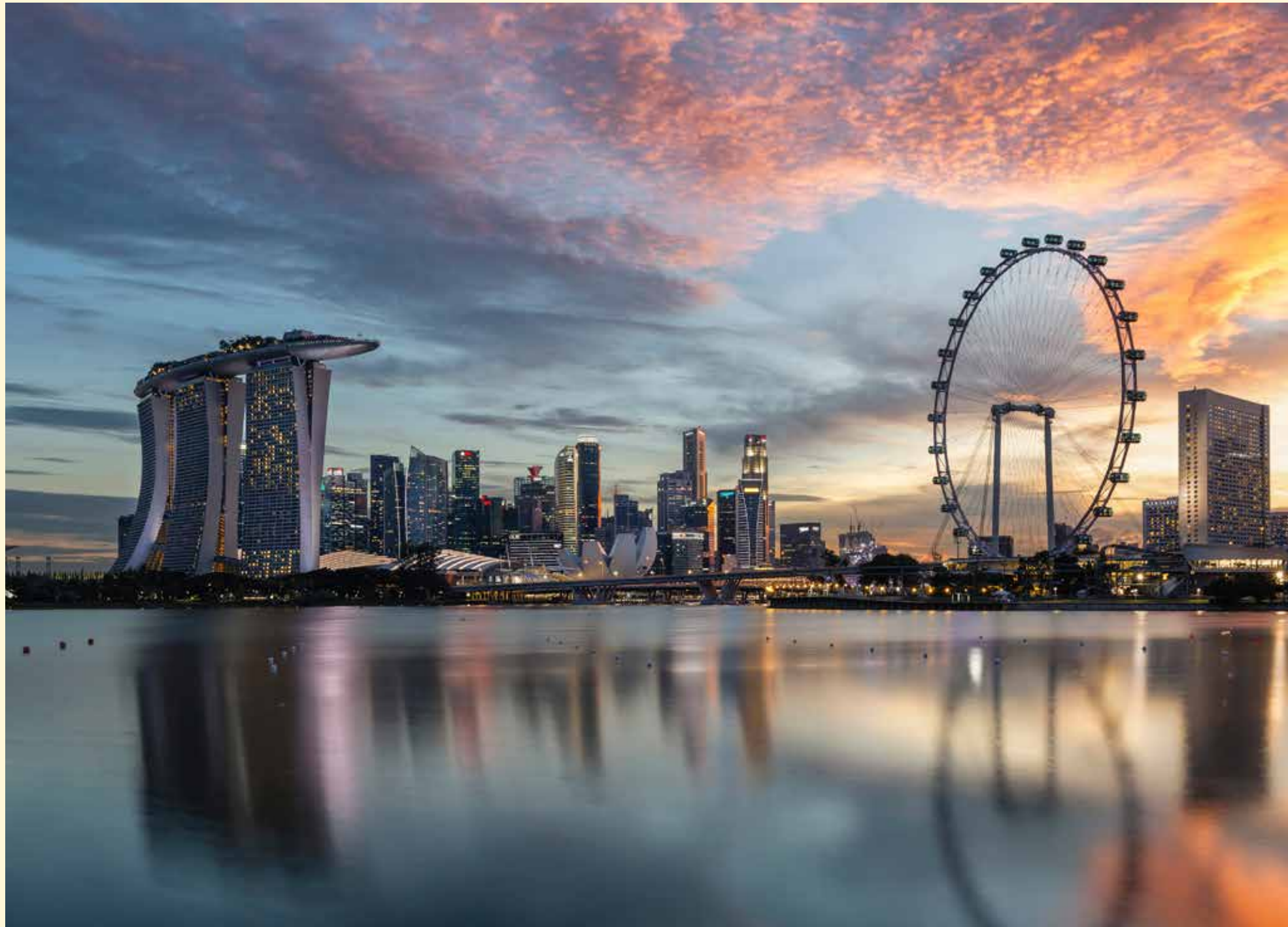
ENJOY 5-STAR HOSPITALITY DELIVERED BY INTERNATIONAL BRANDS IN THE ICONIC MARINA BAY DISTRICT