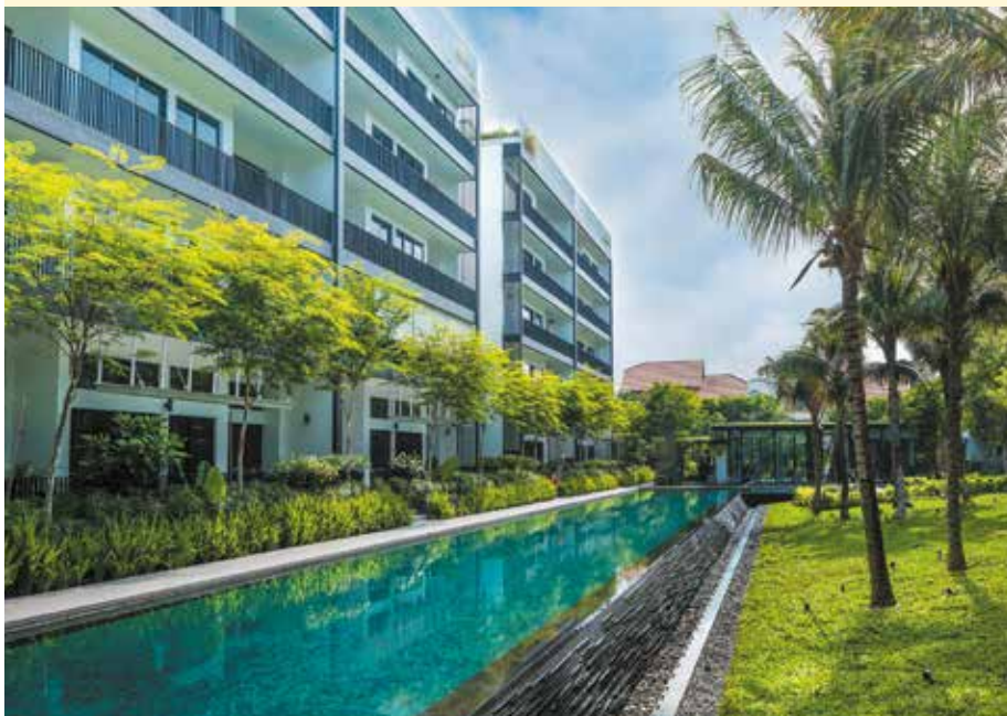
VILLAGE AT PASIR PANJANG