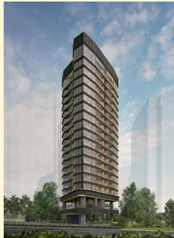
ONE DRAYCOTT (ON-GOING)