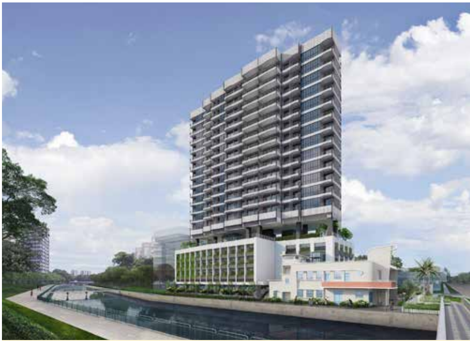
JUI RESIDENCES (ON-GOING)

JUI RESIDENCES (ON-GOING) 117 units of contemporary residences, inspired by heritage. Facing Serangoon Road, and next to Kallang Park Connector Network.