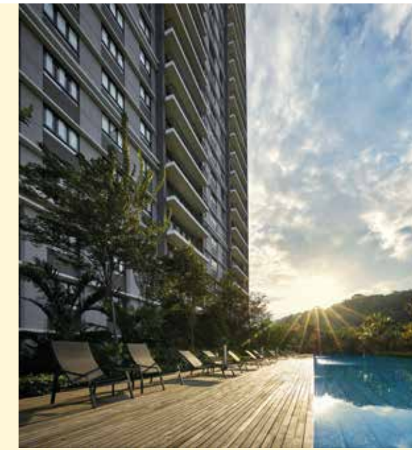
WINDOWS ON THE PARK

AMAN SARI Located in Puchong, this development comprising of semi-D's and bungalow homes in a gated and guarded enclave.