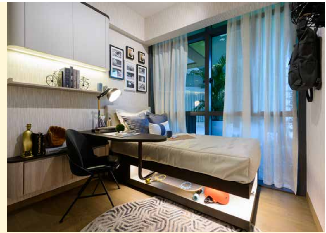
BEDROOM 4 (TYPE D1) SHOW UNIT PHOTO

The materials and finishes chosen are simple and without pretence and fuss, so as to be in harmony with its environment. Yet every residence is without question a luxury home.