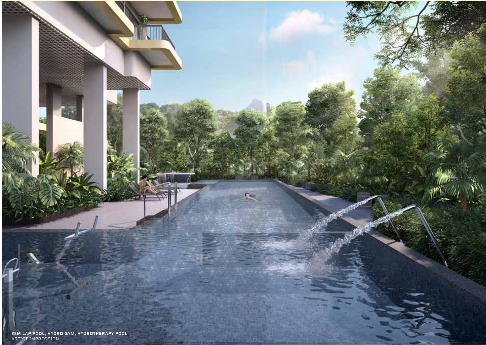
25M LAP POOL, HYDRO GYM, HYDROTHERAPY POOL ARTIST IMPRESSION