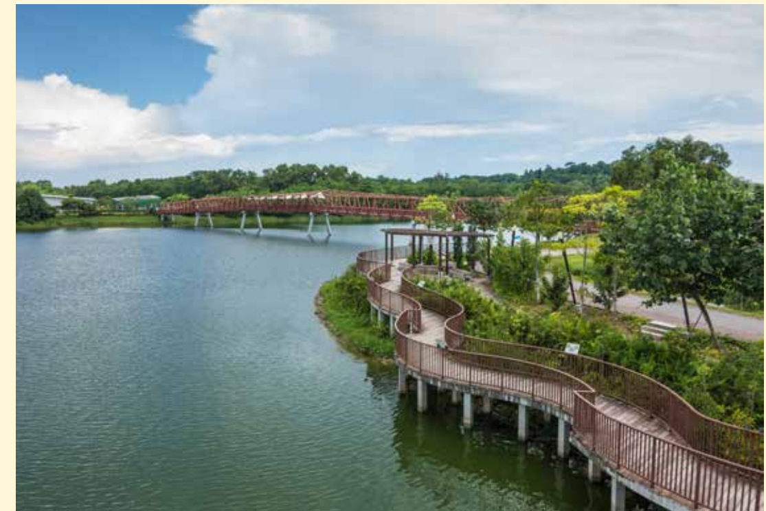
CAPTURE INSTAGRAM-WORTHY MEMORIES AT PUNGGOL TOWN

Just few stops away are the established city centres (Raffles City, City Hall), financial business districts (Marina Bay Financial Centre), business parks (Paya Lebar Central), shopping belts (Orchard, Bugis, Marina Bay Sands), iconic landmarks (Gardens by the Bay, Esplanade, Fullerton Bay, and more), and a new medical centre (Novena). Choose from sky-high fine dining, restaurants, contemporary rooftop cafes, bistros by the river or enjoy a fabulous staycation at the many uber-luxury hotel brands or one-of-a-kind themed designer hotels. Swing into many amazing activities such as the annual international Formula 1 Grand Prix, Prudential Carnival, Artbox, live concerts at Padang, fireworks and much more.