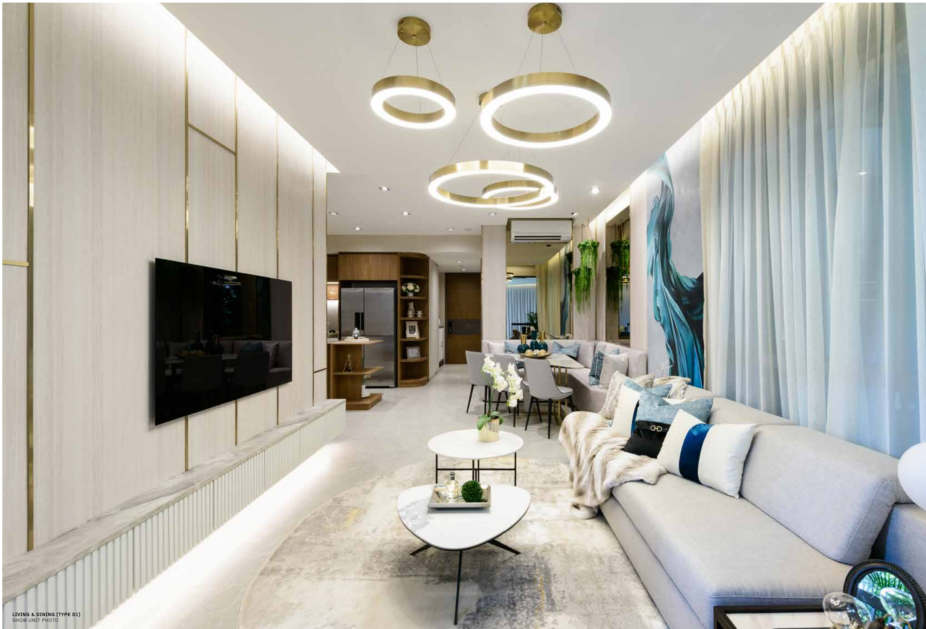
LIVING & DINING (TYPE D1) SHOW UNIT PHOTO