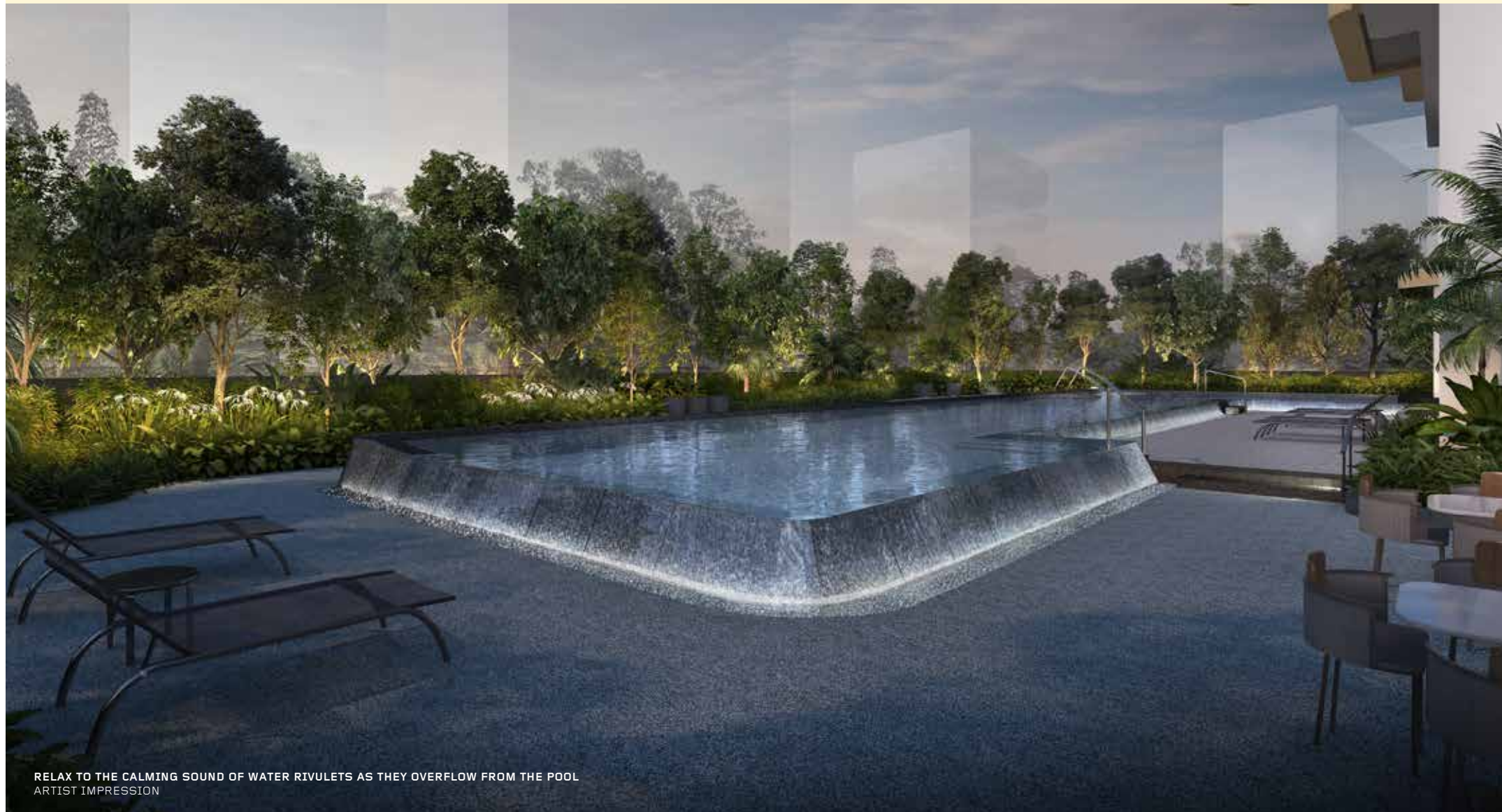
RELAX TO THE CALMING SOUND OF WATER RIVULETS AS THEY OVERFLOW FROM THE POOL ARTIST IMPRESSION

MYRA's central feature is its series of interconnected pools, anchored by a 25m lap pool, all of which create multiple water edges with each edge opening up to a different space, and the luxury of different experiences.